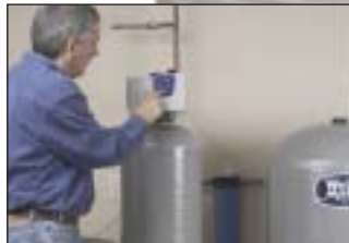
Installing a water softener system with a Fleck 7000 valve delivers the highest flow rates available in a residential system.

and 1.25 inch pipes, the 7000 high flow rate control valve delivers a continuous flow of 25 GPM to 35 GPM (with optional piston) at 15 psi drop. That makes it the softener of choice for new housing where more plumbing fixtures can create a bigger demand for water. What's more, the 7000 valve features the highest backwash flow rate. That means higher efficiency and performance, especially for filter applications.