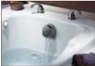
A water softener system with a Fleck 7000 valve meets water demands of newer and larger homes.